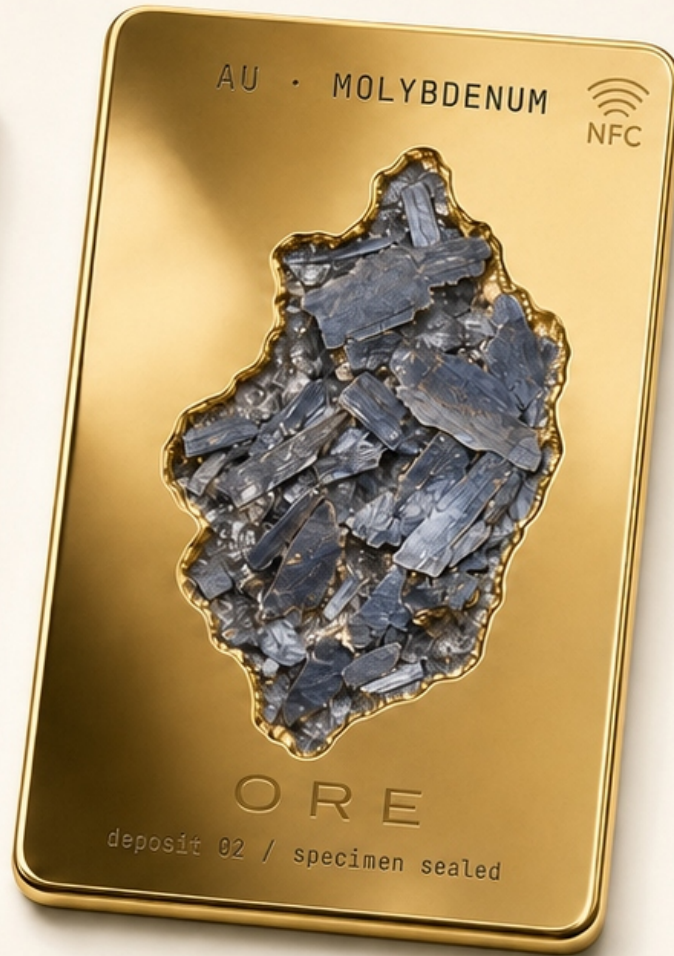
gold / molybdenum