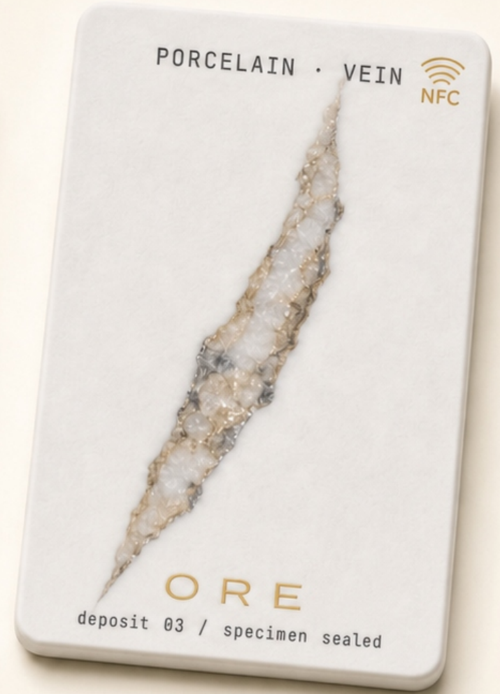
porcelain / vein